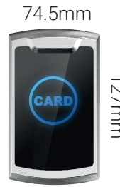
Wall mounted reader